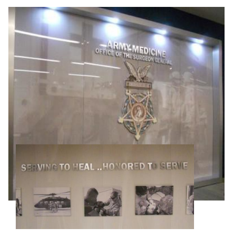
Signage and graphics installed at the Office of the Surgeon General, Falls Church, Virginia.

The program provides and installs Integrated Modular Medical Support Systems (IMMSS), non-systems furniture and furnishings, and artwork and graphics for hospitals, clinics, pharmacies, laboratories, dental clinics, veterinary clinics, administrative and logistical facilities, and research, training/classroom and medical warehouse functions.